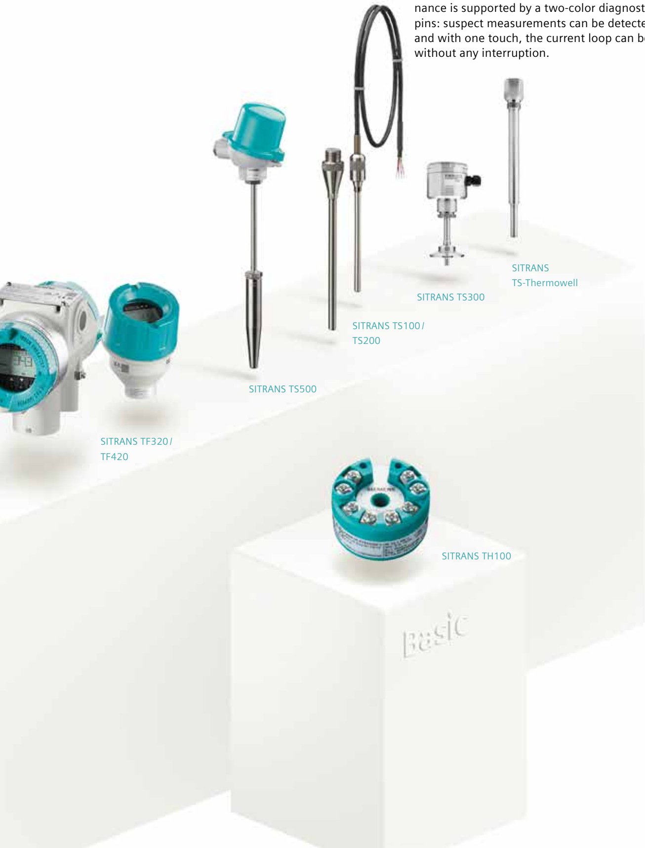
SITRANS TF320/ TF420

sensor-transmitter matching. As an added benefit, maintenance is supported by a two-color diagnostics LED and test pins: suspect measurements can be detected at a glance – and with one touch, the current loop can be measured without any interruption.