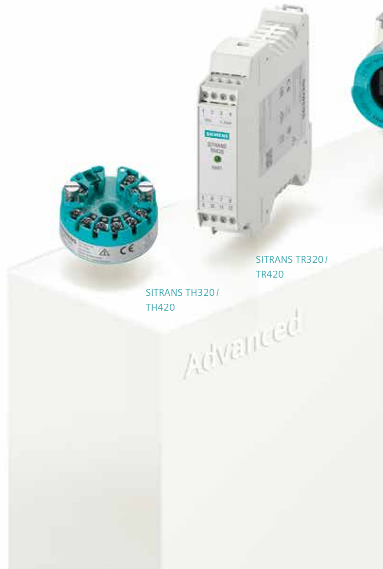
SITRANS TH320 / TH420