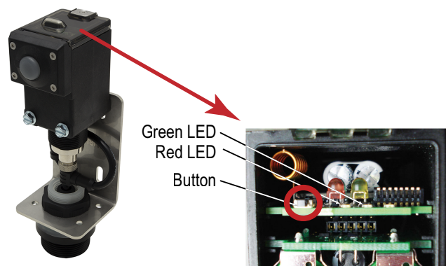
Q45 Button and LEDs