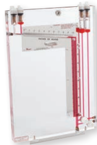
Inclined-Vertical Manometer Double Column