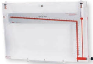
Inclined-Vertical Manometer Single Column