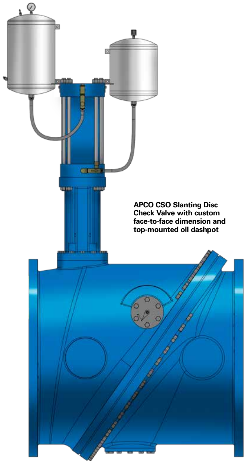
APCO CSO Slanting Disc Check Valve with custom face-to-face dimension and top-mounted oil dashpot

In addition to the custom face-to-face dimension, the specification also called for a field-replaceable seat held in place with lock screws; a ductile iron disc with double-clevis connection to a ductile iron disc arm; and a hydraulic oil-filled buffer dash pot to permit positive non-slam control closure of the disc. The hydraulic buffer needed to be externally adjustable to control the disc during the last 10 percent of closure to prevent slam and water hammer. The APCO CSD Slanting Disc Check Valve included all these features as standard.