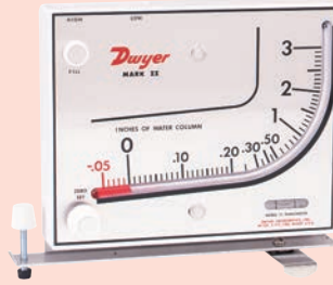
Mark II Model No. 25 inclined-vertical manometer. (shown with optional A-612 portable stand)