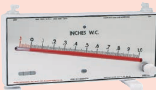
Mark II Model No. 40-1 inclined manometer