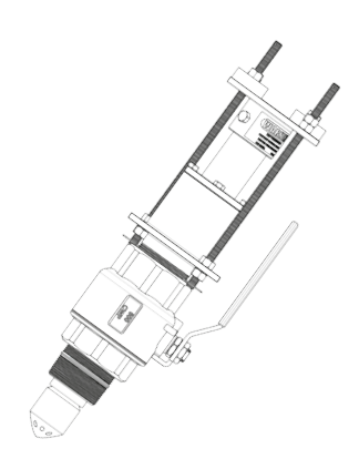
SPI Mag 2" Sensor

The SPI Mag<sup>™</sup> (Single Point Insertion) Electromagnetic Flow Meter is a hot tappable single point insertion flow meter for measuring forward flow. The sensor is available for one-inch or two-inch taps, depending upon line size and application.