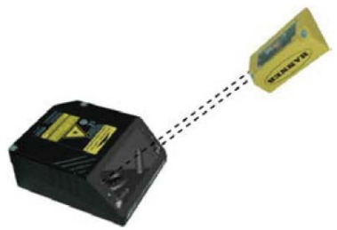
Mounting Deflection Mirror

3 Mount the TCNM-ACM-102R 102° scanning window so that the opening face is at 90° with respect to the scanner body. Tighten the two cover screws.