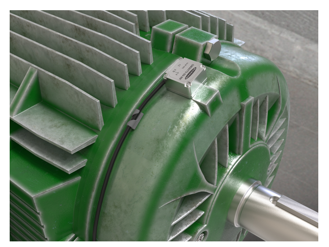
Figure 2. Install the vibration sensor

1. Align the vibration sensor's x- and z-axes.