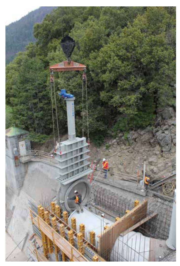
A Hilton Throttling Knife Gate Valve is installed at a California dam project.

Additionally, with a standard knife gate valve, the discharge flange is the same size as the inlet flange, which will not allow sufficient airflow to enter the discharge side of the valve to prevent cavitation.