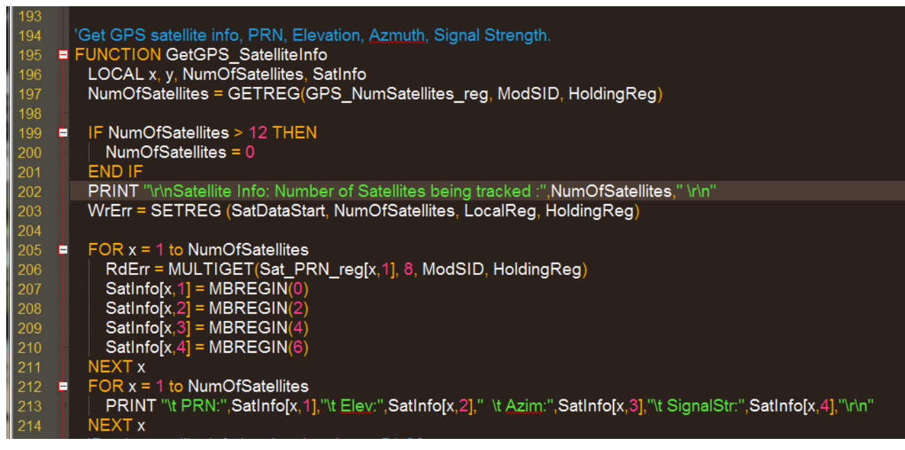
Figure 1 A text editor with syntax highlighting

Use any text editor tool to create a script basic file. A good text editor that numbers lines and color codes the language syntax makes code easier to read and shows typing or copy/paste mistakes in the code. ScriptBasic is close to VisualBasic for syntax highlighting. After a ScriptBasic program is created, save the file using the extension .sb . The filename needs to be filename.sb for the DXM Controller to recognize the file as a ScriptBasic file.