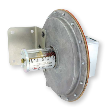
Model 1640 null switch.