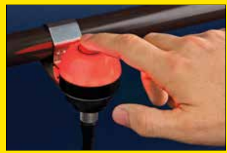
Indication of status is simple with the K50 lighted operators, which are easily actuated with the touch of a finger, hand or whole palm.