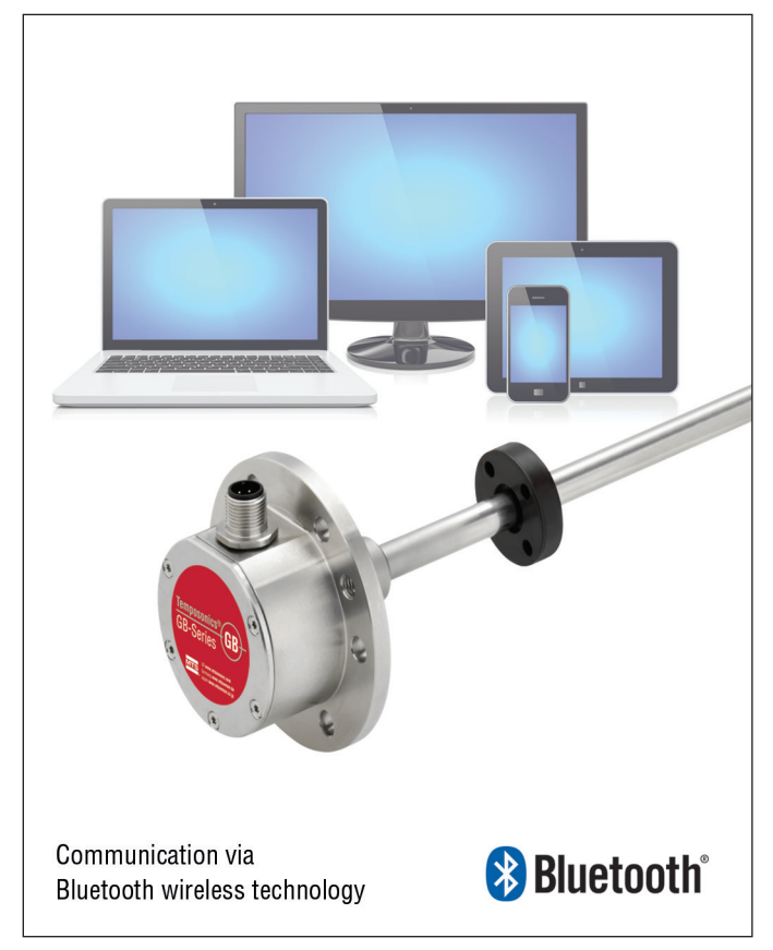
Fig. 2: Bluetooth wireless technology

The set points, start and end position of the measurement, can be modified after installation of the Temposonics® GB sensor. Programming can be carried out using the standard connection cable. Optionally the sensor offers Bluetooth® 1 connectivity for programming. In the case of Bluetooth® connectivity, set points can be modified even when the sensor is no longer accessible. The maximum range between sensor and receiver is 5 m (16 ft). With this option it is still possible to program the sensor via the cable connection.