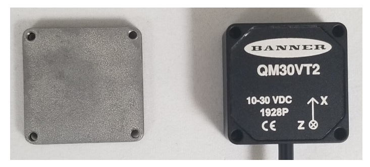
Figure 9. BWA-QM30-FMSS with magnet facing down