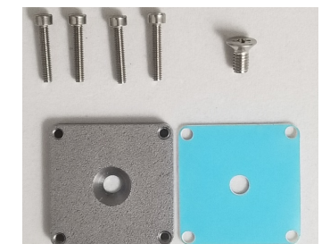
Figure 1. Bracket kit parts