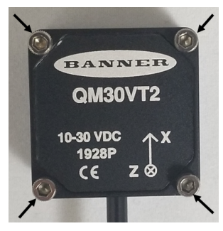
Figure 10. QM30VT2 mounted to the BWA-QM30-FMSS bracket

5. Place the sensor on the equipment to be monitored.