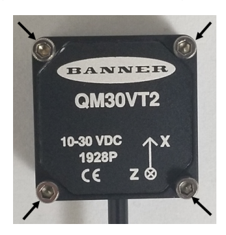
Figure 7. QM30VT2 mounted to the BWA-QM30-FTAL bracket

The maximum torque for socket head screws is 0.5 N·m. Do not over tighten.