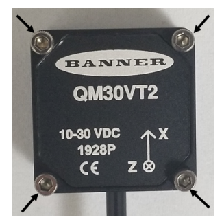
Figure 4. QM30VT2 screwed onto the BWA-QM30-FTAL bracket

3. Screw the sensor to the bracket with the provided screws using a 2 mm Hex Allen wrench. The maximum torque for socket head screws is 0.5 N·m. Do not over tighten.