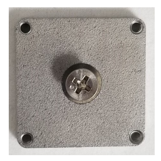
Figure 6. BWA-QM30-FTAL with the flathead screw installed