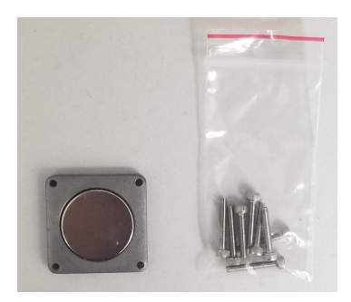
Figure 8. BWA-QM30-FMSS with fasteners

This example uses a QM30VT2, but these steps can also be used on other QM30VT models. Brackets BWA-QM30-FMSS and BWA-QM30-CMAL are not included with the QM30VT sensor and must be purchased separately.